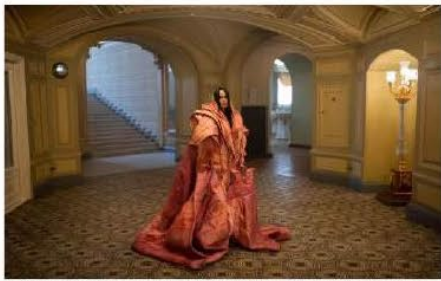
Ukrainian singer Jamala performs for the first time at the National Eurovision Song Contest on Friday, May 19, 2022, at the Liverpool Convention Centre in Liverpool, England. She is performing her new album "Quirin".

LONDON — Jamala and the orchestra were supposed to be onstage, but they were sheltering in a basement.