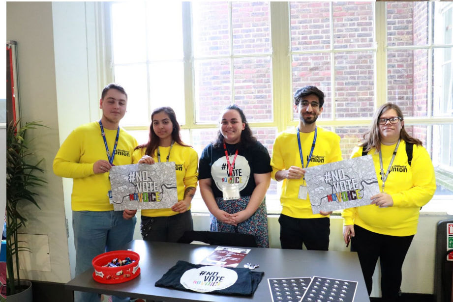
Information and support session in educational settings