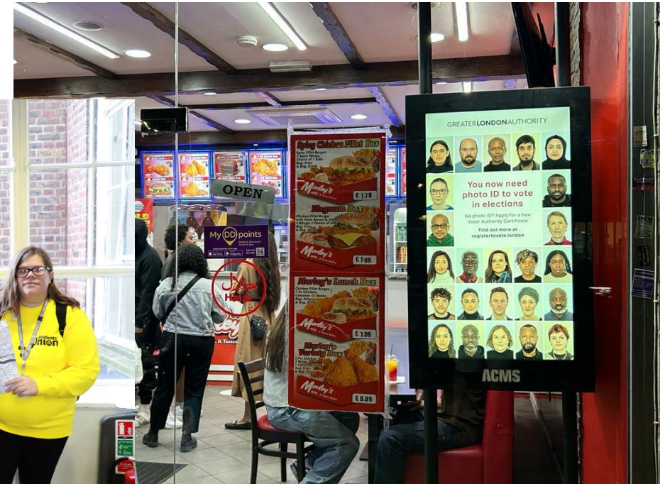
Displays in community high footfall areas